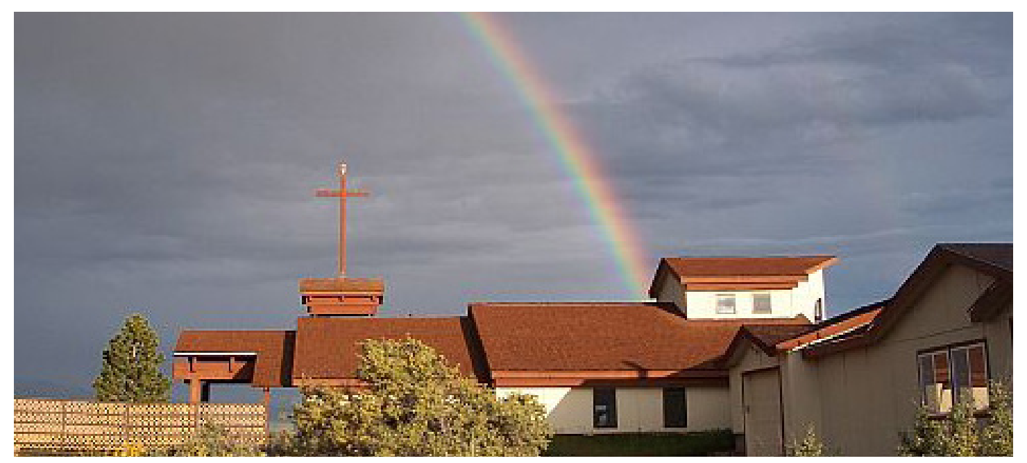
Rainbow over chapel