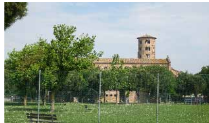
San Apollinare in Classe

We spent more time visiting Ravenna than any other place. Its churches and baptisteries and mausoleums are spectacular examples of the Christian art and architecture of the period between 400 and 700. During those centuries Ravenna was an important residence of the Roman emperors, the capital of the Ostrogoth kingdom of Theoderic and his family, and then the residence of the Byzantine exarches, after the Byzantine armies sent by Justinian reconquered part of Italy. One of the outstanding Christian buildings in Ravenna is St. Apollinare in Classe, named after the first bishop in the area. The church was built in the second quarter of the 6th century. The exterior is very simple. Approaching it one sees a brick façade with an arcade abutting a short tower to the north, with a taller 10th-century bell tower behind.