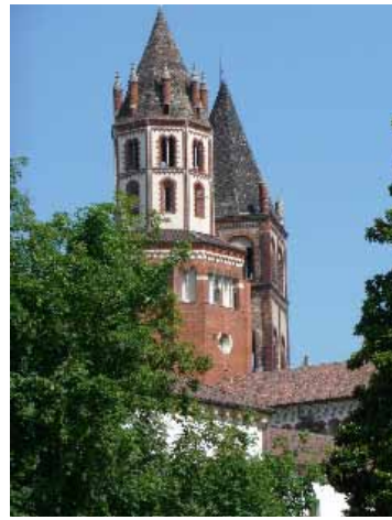
Cupola and Bell Tower