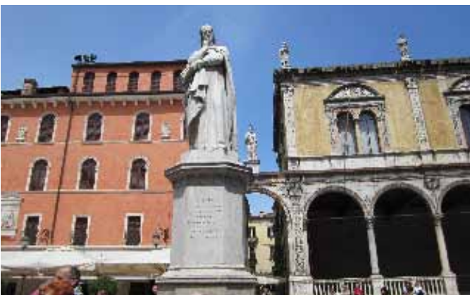
Dante Statue Piazza dei Signori, Verona

It was fitting that we pilgrims pay homage to Dante Alighieri, who cast himself in the role of pilgrim in his Divine Comedy , and who from 1302 until the end of his life was an exile from his beloved Florence. During his exile, Dante stayed in Verona from 1312-1318 with Congrande della Scala (1291-1329). There is a fine statue of Dante in the Piazza dei Signori there. We visited Congrande's tomb at his family's church of Santa Maria Antiqua in Verona. Later, we visited Dante's tomb in Ravenna. Near the tomb is the spot where Dante's remains were buried to keep them safe during the bombing of 1944-1945. Next to the tomb is the Church of San Francesco where Dante's funeral was held.