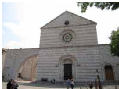
Assisi Basilica of St. Clare