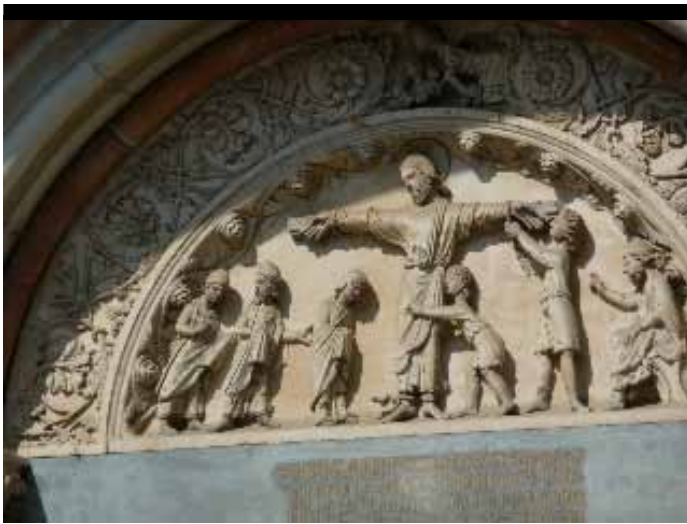
Martyrdom of St. Andrew

alternating layers to give the striped appearance found in other Italian churches.