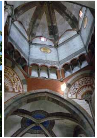
Cupola from the Inside