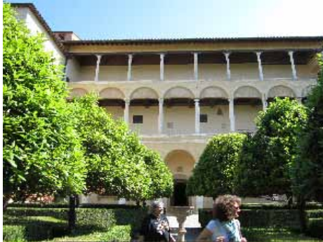
Pienza Palazzo Piccolomini. Loggias Overlooking Garden

Pope Pius III (1439-1503) was the nephew of Pius II, who made him bishop of Siena when he was only 21, and shortly afterward promoted him to cardinal. He served effectively as a papal diplomat. In 1502 he provided for a room attached to the cathedral of Siena to house Pius II's library. He had it adorned with frescoes by Pinturicchio showing scenes from his uncle's life. He was elected pope in 1503 but died twenty-six days later.