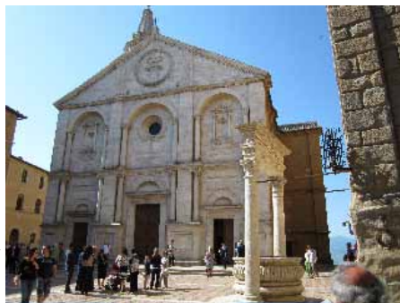
Pienza Cathedral of Pius II