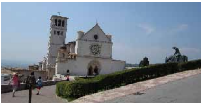
Assisi Basilica of St. Francis