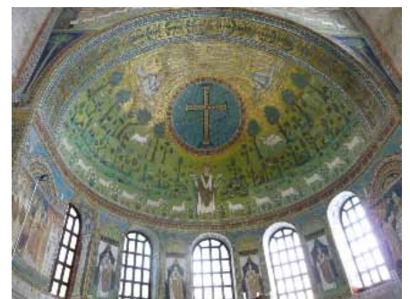
San Apollinare in Classe

the monastic life; he eventually founded the Camaldolese Benedictines. The glory of the church is the 6th-century mosaics in the apse. The central scene is of Christ's Transfiguration. Surprisingly, Christ is represented by a great jeweled cross set against a round background, representing a blue sky with 99 stars. In the sky, Moses and Elijah witness to Christ. Three sheep, representing Peter, James and John, look toward the cross. At the top, the hand of the Father reaches down. Below, St. Apollinaris, surrounded by birds and trees, stands with his arms raised in prayer. On the arch above the apse Christ holds a book in one hand and gives a blessing with the other. He is flanked by mosaics of the four evangelists.